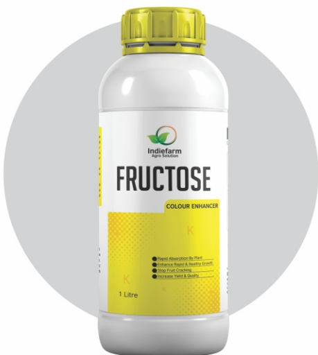
Available In : 500 ml & 1 Litre