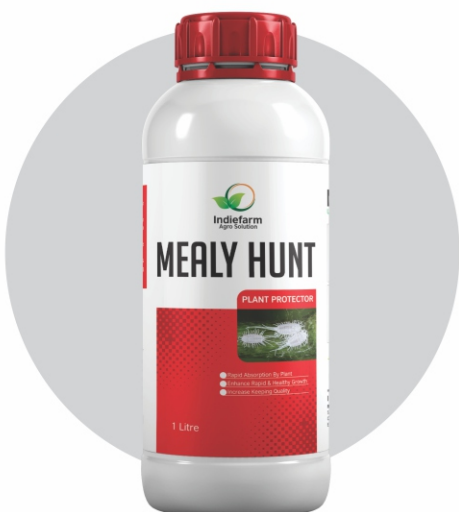
Available In : 500 ml & 1 Litre