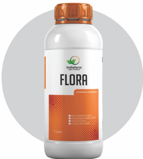
Available In : 500 ml & 1 Litre